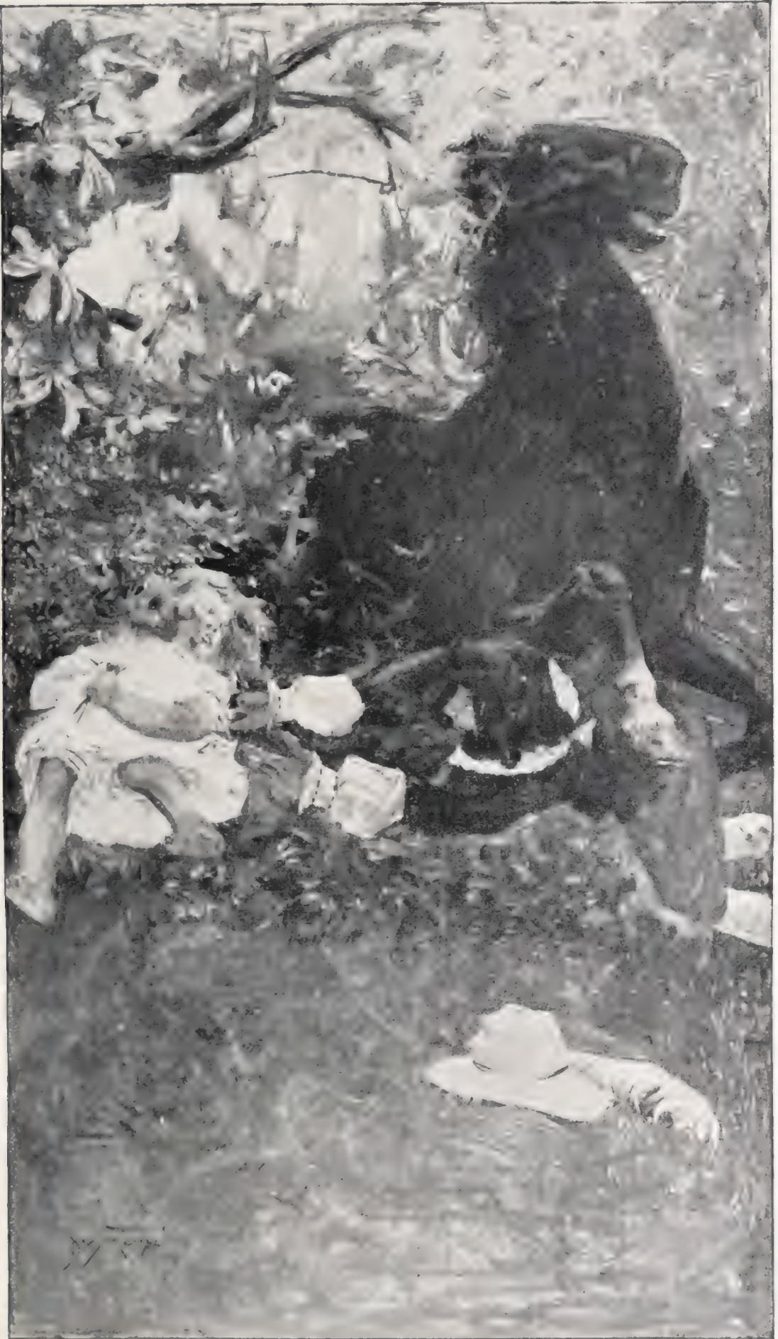
“ I FLUNG MYSELF UPON HER AND THREW HER LIKE A FEATHER TO ONE SIDE.”